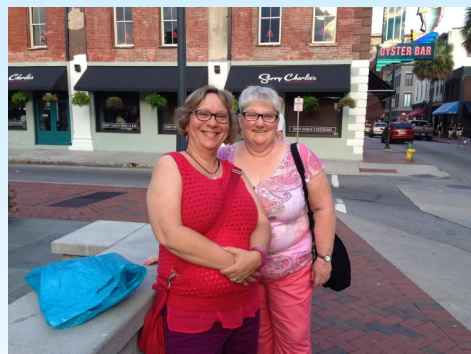
Top: Seeing the sites