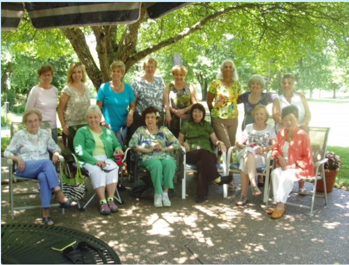
Pictured: Summer Picnic Group

As we reflect on past information and experiences, we are ready to begin this new Chapter year with our upcoming planning meeting. We wish all the DKG Chapters a great program year!