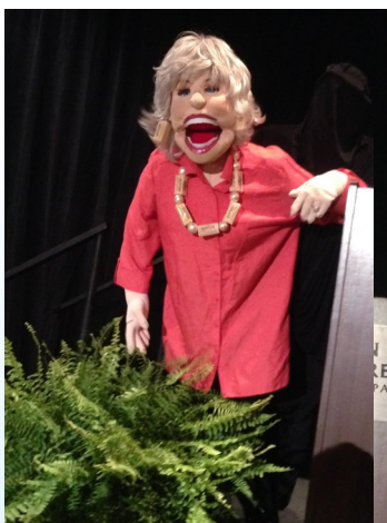
Left: Special Guest at General Sessions