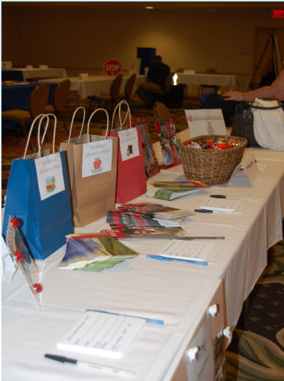
Bags were labeled for Elementary, Middle, and High School